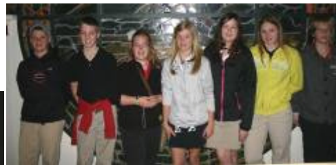
6th grade students visit the OHIO STATE HOUSE and MUSEUM

The next Market Day Sale will be held on Saturday June 2nd, 2012. Order forms are available in the back of Church or in the Parish/School offices. Orders can be submitted to the Parish/School Offices by Friday May 25th or can be made on-line at MarketDay.com until 11:00pm Tuesday May 29th. This will be the last Market Day sale for this school year. There will not be a sale in July. Market Day sales will resume on August 11. Thank You for supporting Norwalk Catholic School.